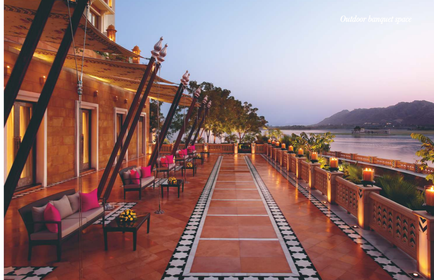
Outdoor banquet space

Every meeting or celebration receives personalized service. The banquet halls with over 4,500 sq feet space offer state of the art facilities for conferences and banquets for up to 150 people.