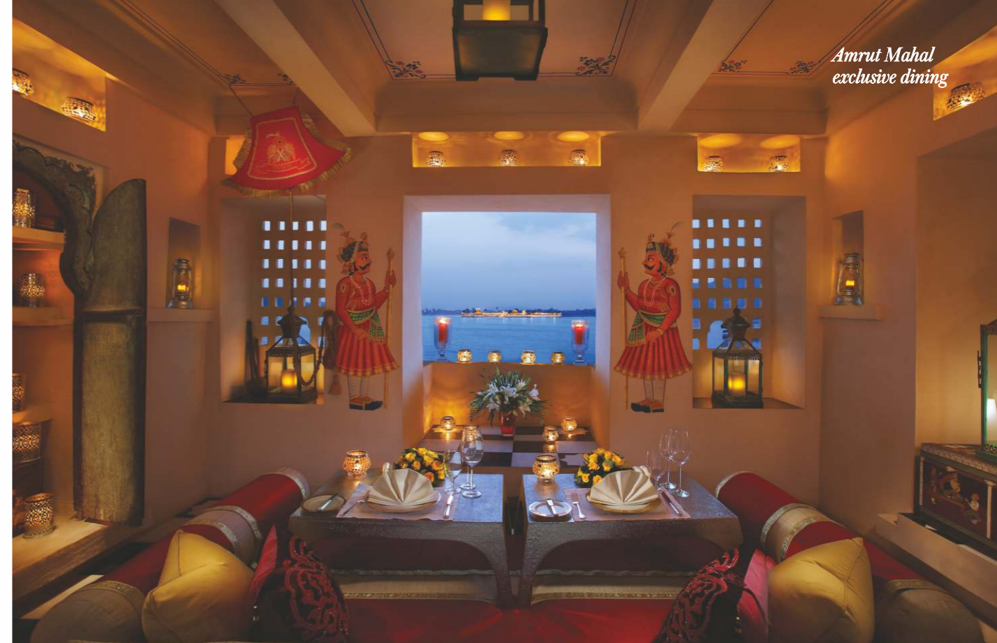
Amrut Mahal exclusive dining