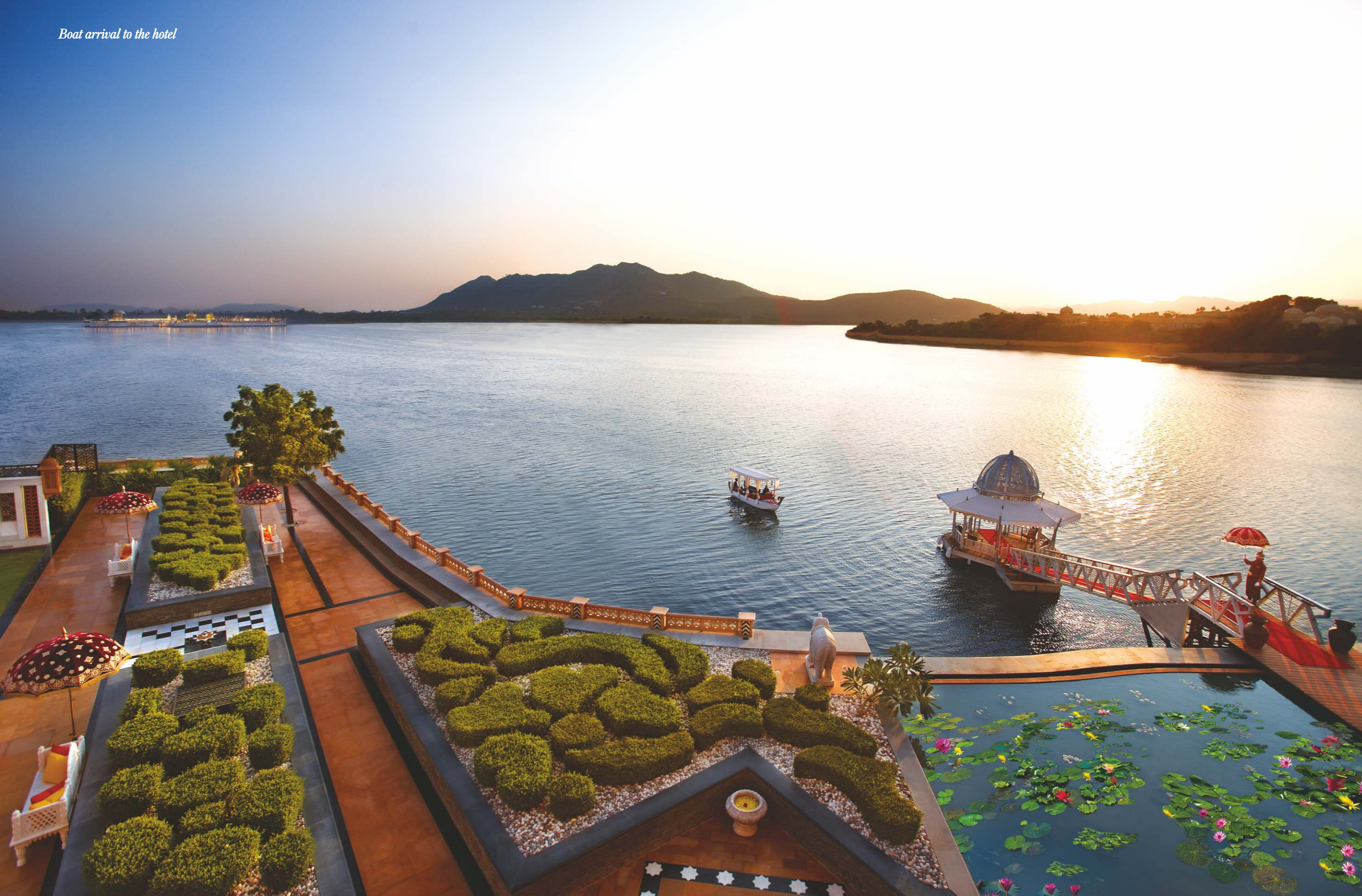
Boat arrival to the hotel