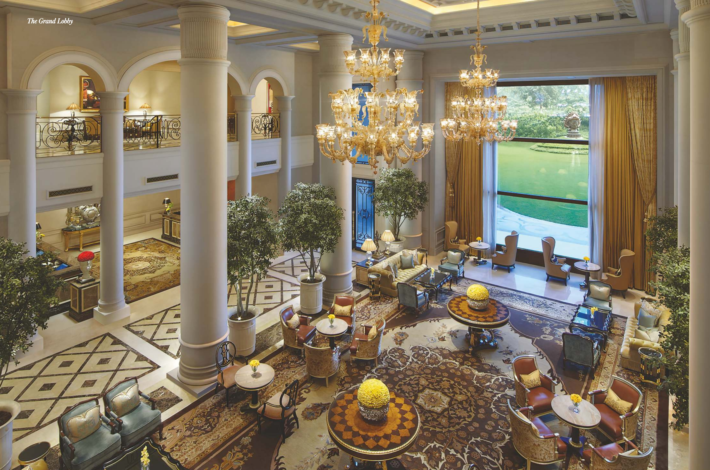
The Grand Lobby