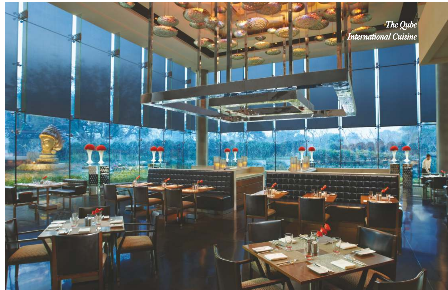
The Qube International Cuisine