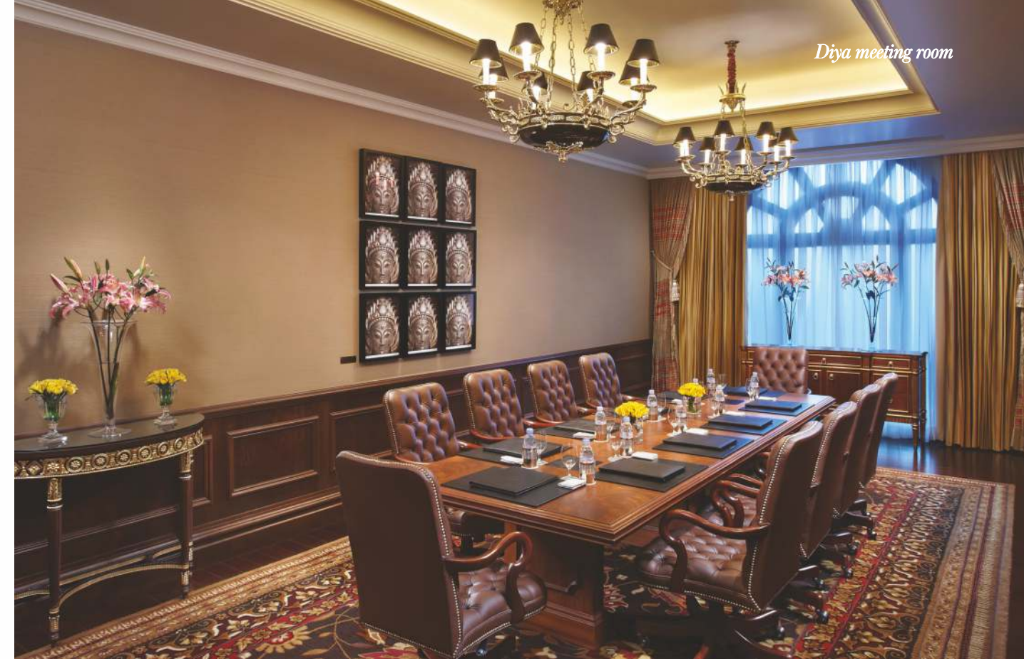
Diya meeting room

and elite social gatherings of up to 400 guests. Business meetings can be efficiently organized at any of the 8 meeting rooms which offer the most advanced technology in an elegant setting.