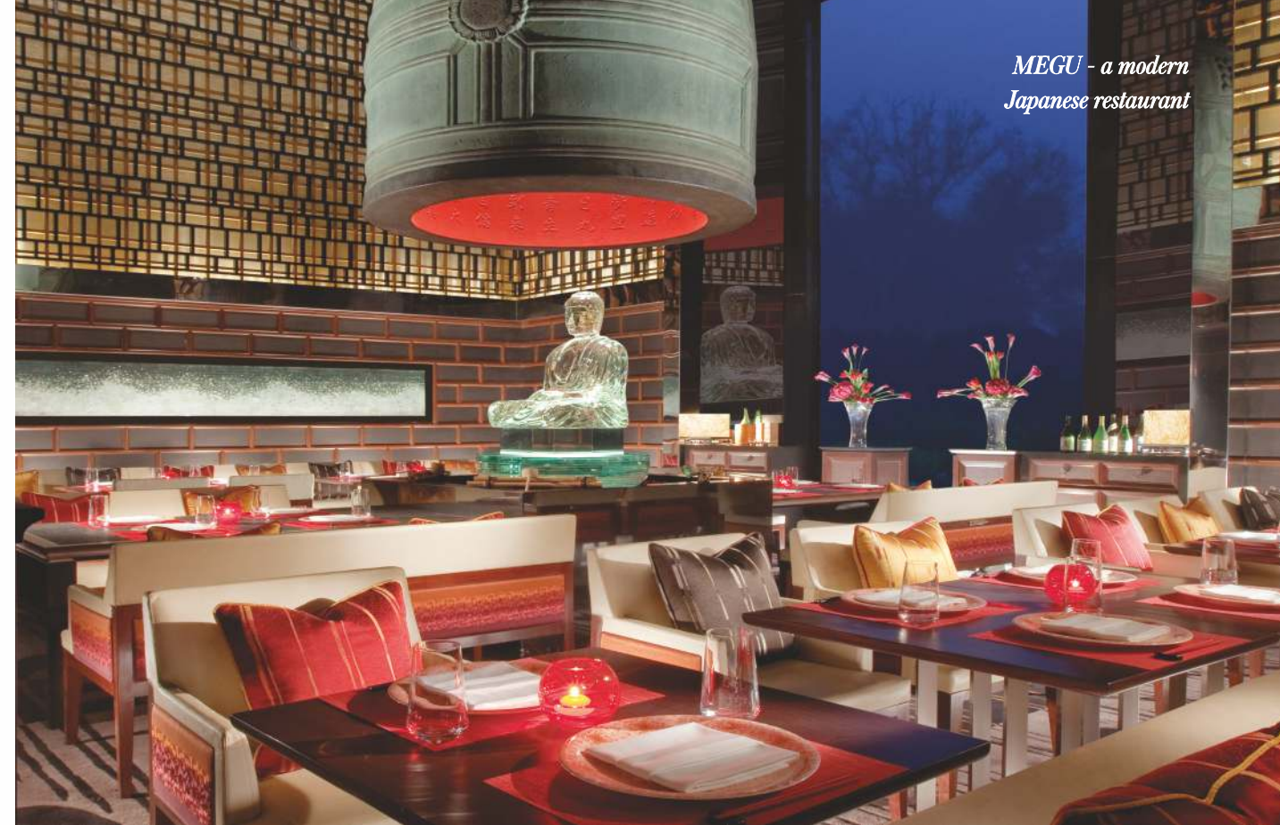
MEGU - a modern Japanese restaurant