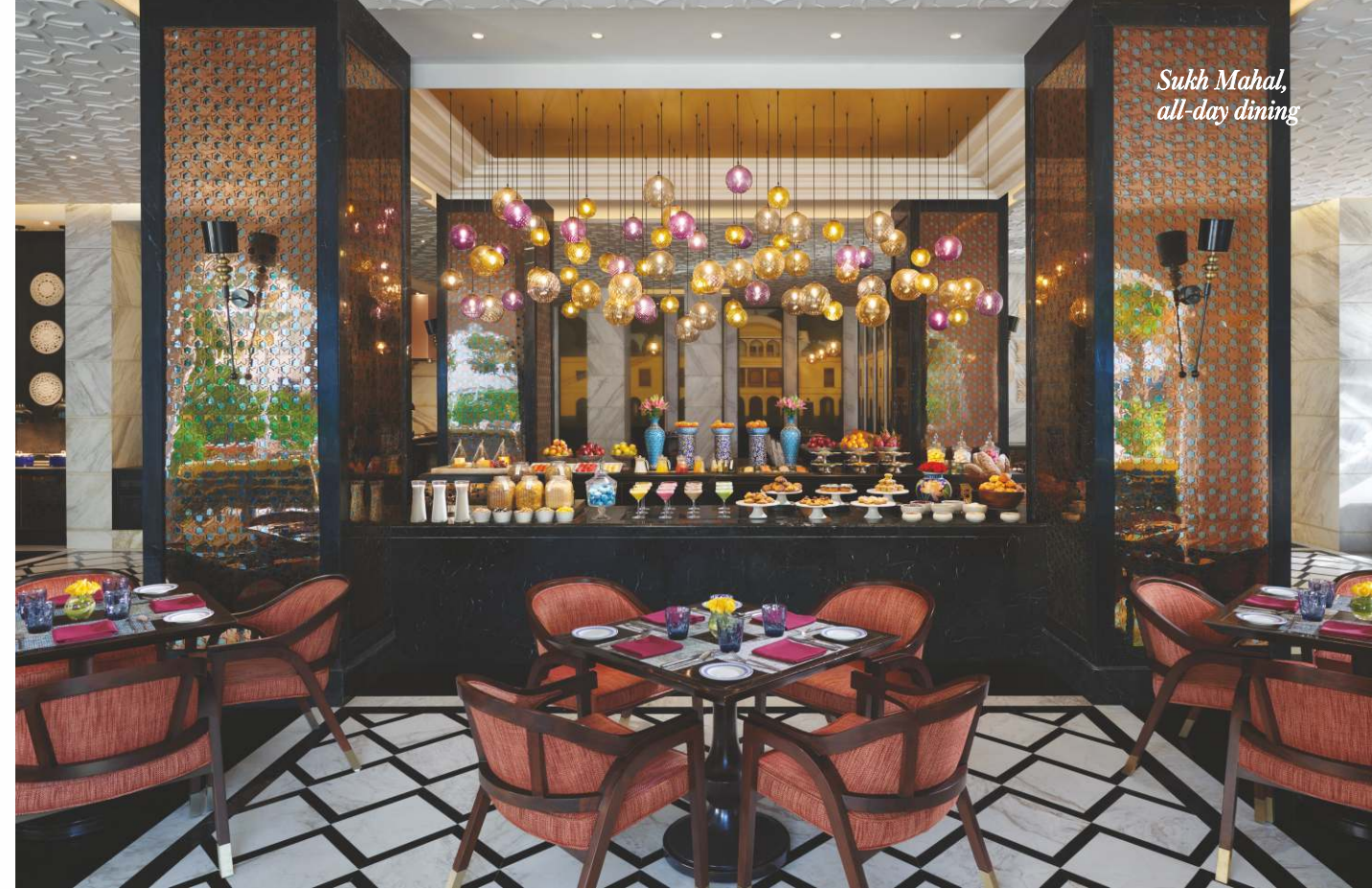
Sukh Mahal, all-day dining