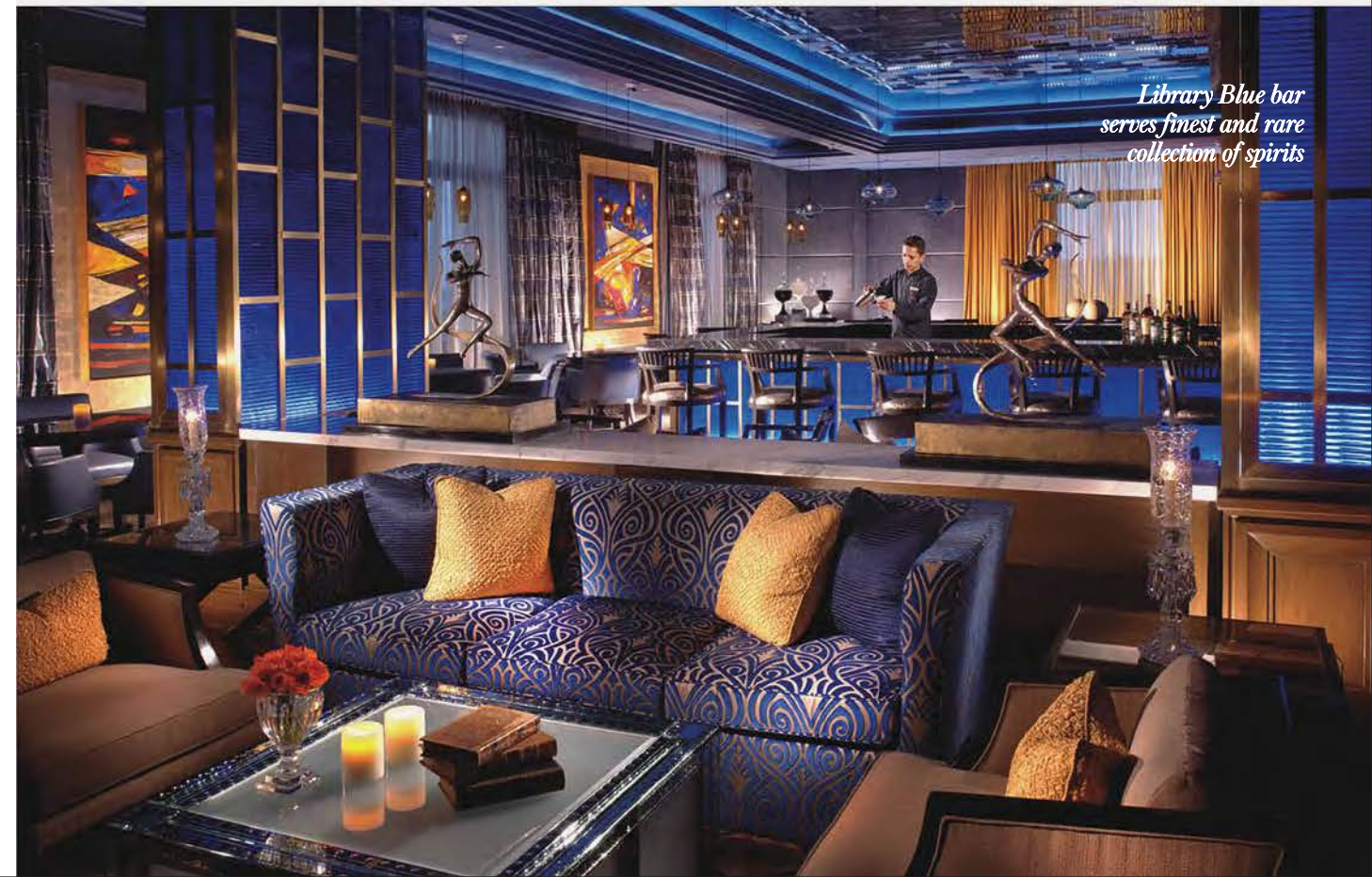
Library Blue bar serves finest and rare collection of spirits