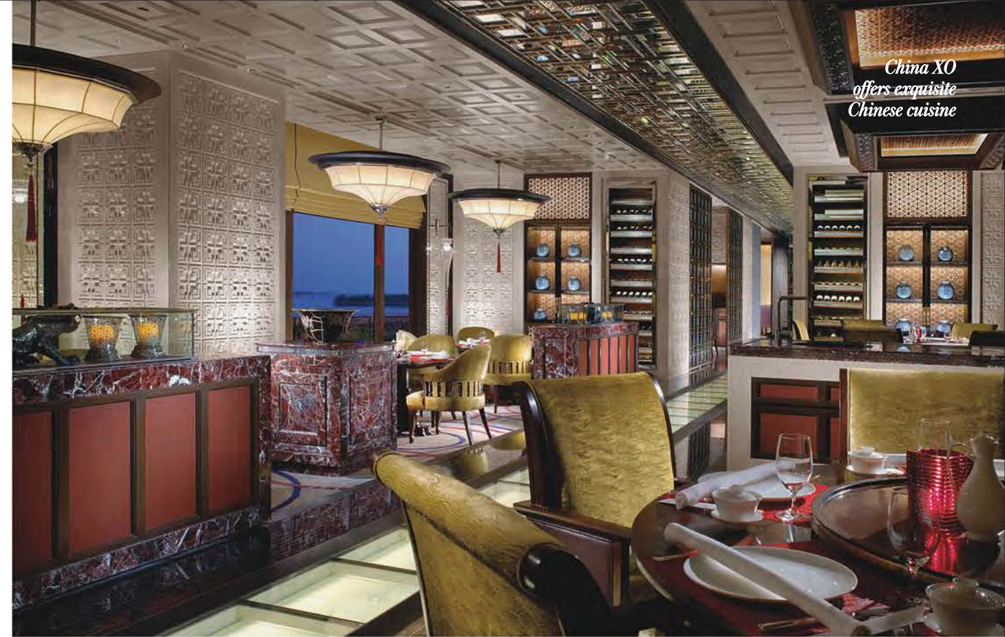
China XO offers exquisite Chinese cuisine