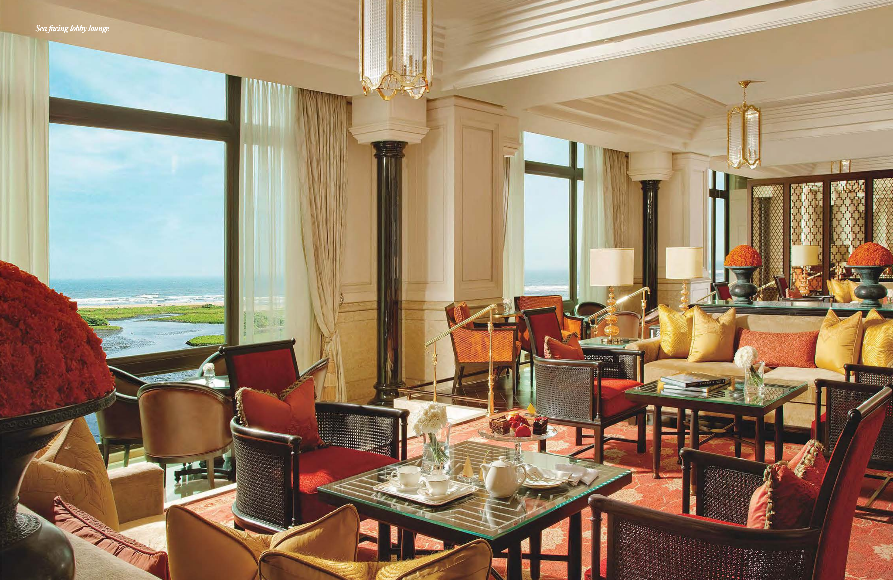
Sea facing lobby lounge