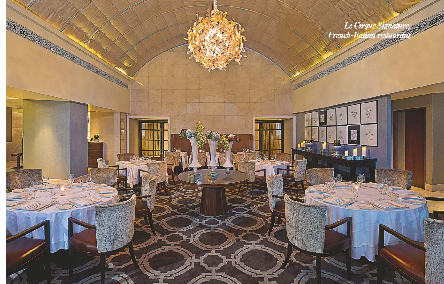
Le Cirque Signature, French-Italian restaurant