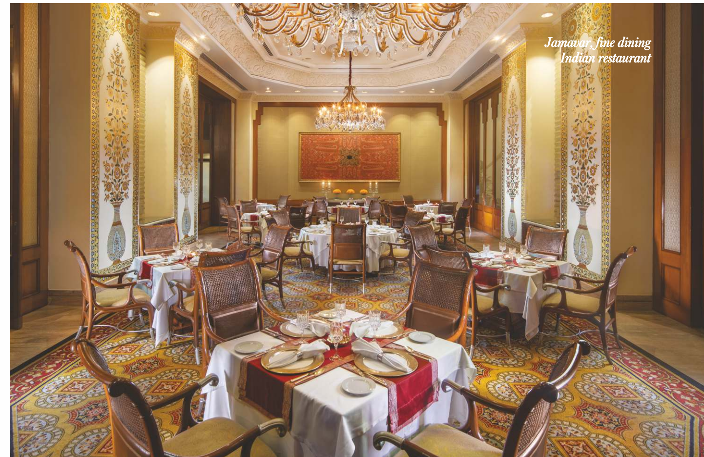
Jamavar, fine dining Indian restaurant