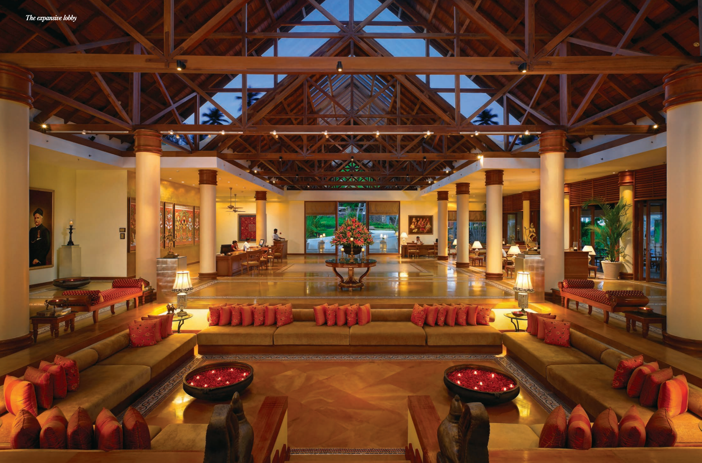
The expansive lobby