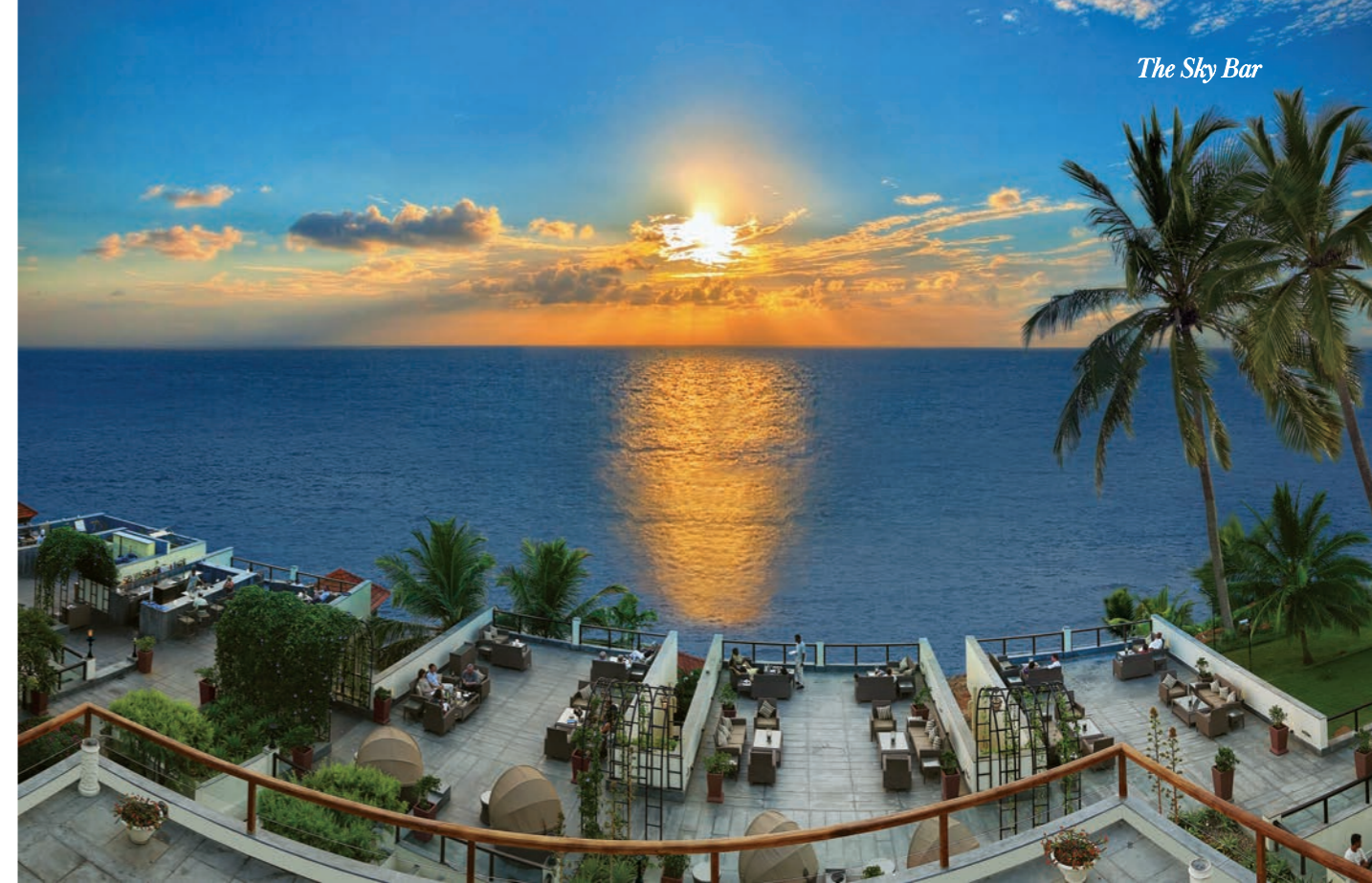
The Sky Bar