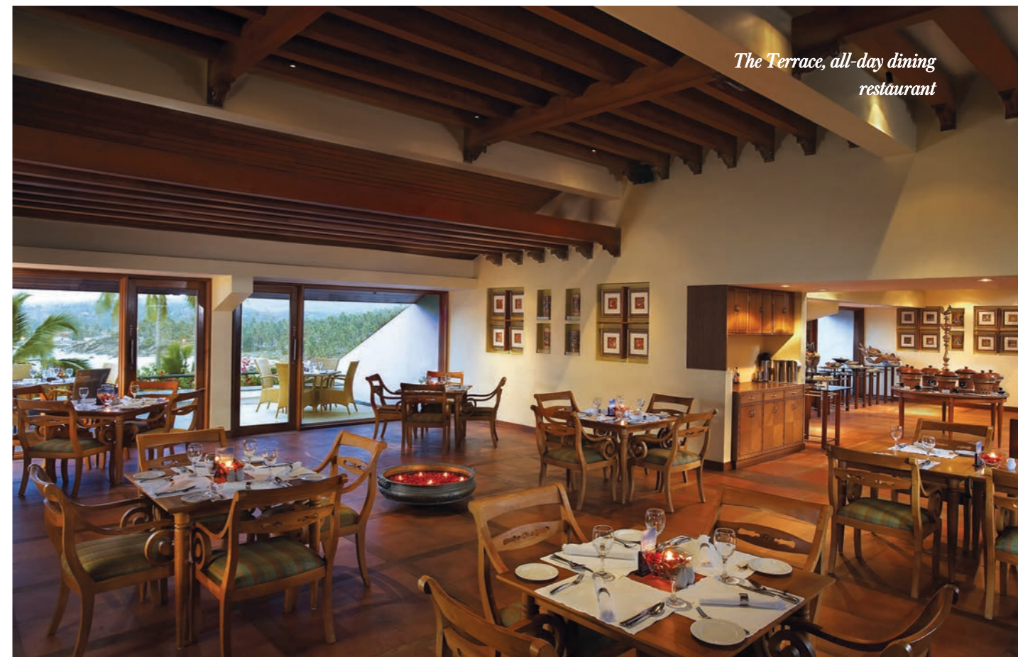
The Terrace, all-day dining restaurant