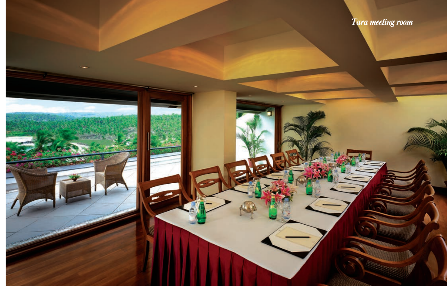
Tara meeting room

Tara or Roshni meeting rooms cater to 12-15 people and have panoramic views of the Kovalam coastline. For weddings and social gatherings, we have Pandhal, with its traditional layout and architectural elements which can seat about 500 guests. With the sea as a backdrop, the beach venue is perfect for weddings for up to 900 people.