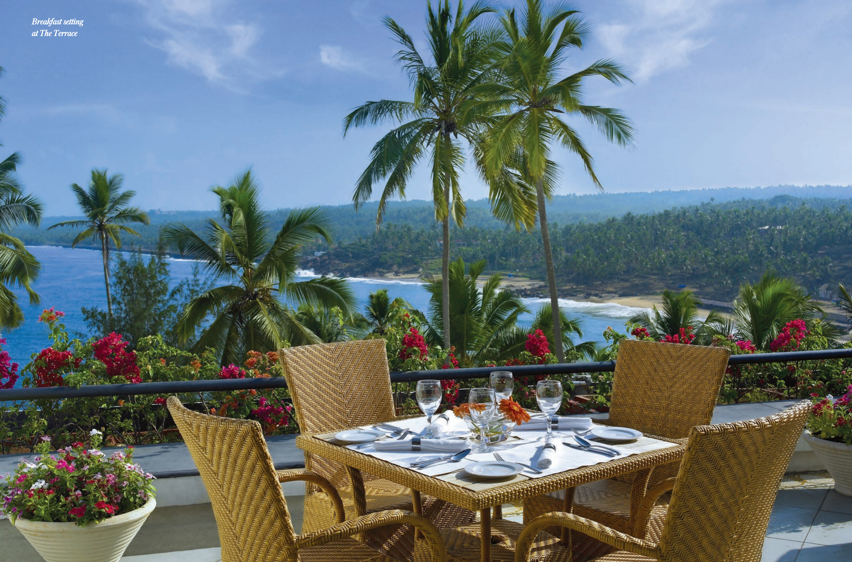
Breakfast setting at The Terrace