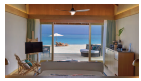
Beach Villas with Pool (172sqm) Total 20 Units – Pool: 4x6m