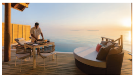
Superior Water Villas with Pool (230sqm) Total 3 Units – Pool: 4x10m

Water Villas with Pool (172sqm) Total 39 Units – Pool: 8x3m