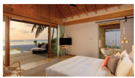
Family Beach Villas with Pool (220sqm) Total 7 Units - Pool: 4x6 m - two bathrooms

Water Villas with Pool (172sqm) Total 39 Units – Pool: 8x3m