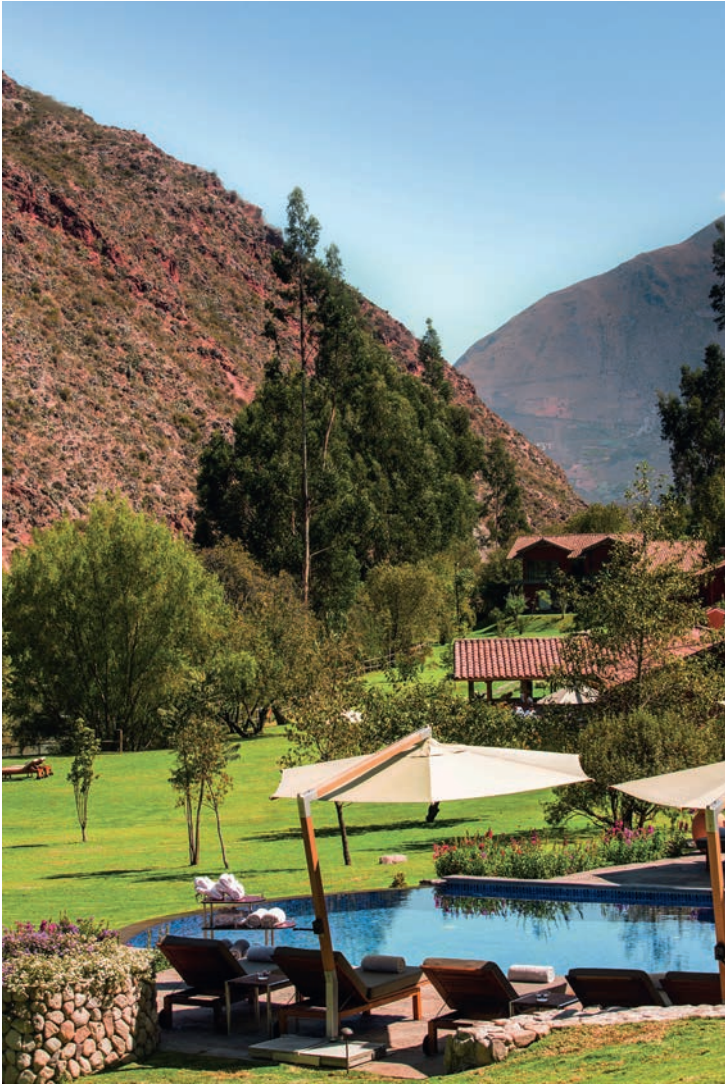
RIO SAGRADO, A BELMOND HOTEL, SACRED VALLEY