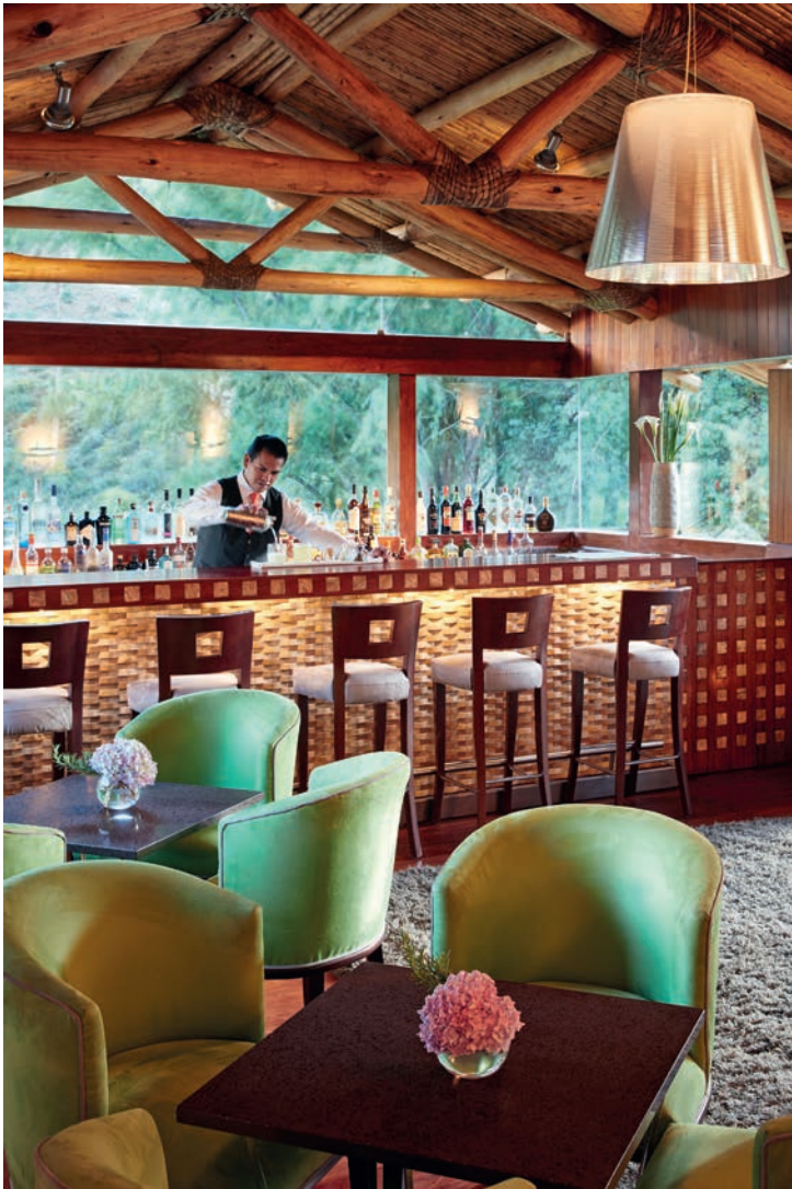
RIO SAGRADO, A BELMOND HOTEL, SACRED VALLEY