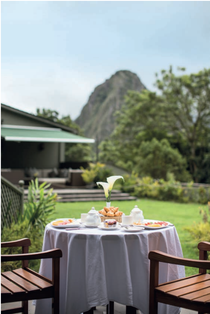
SANCTUARY LODGE, A BELMOND HOTEL, MACHU PICCHU